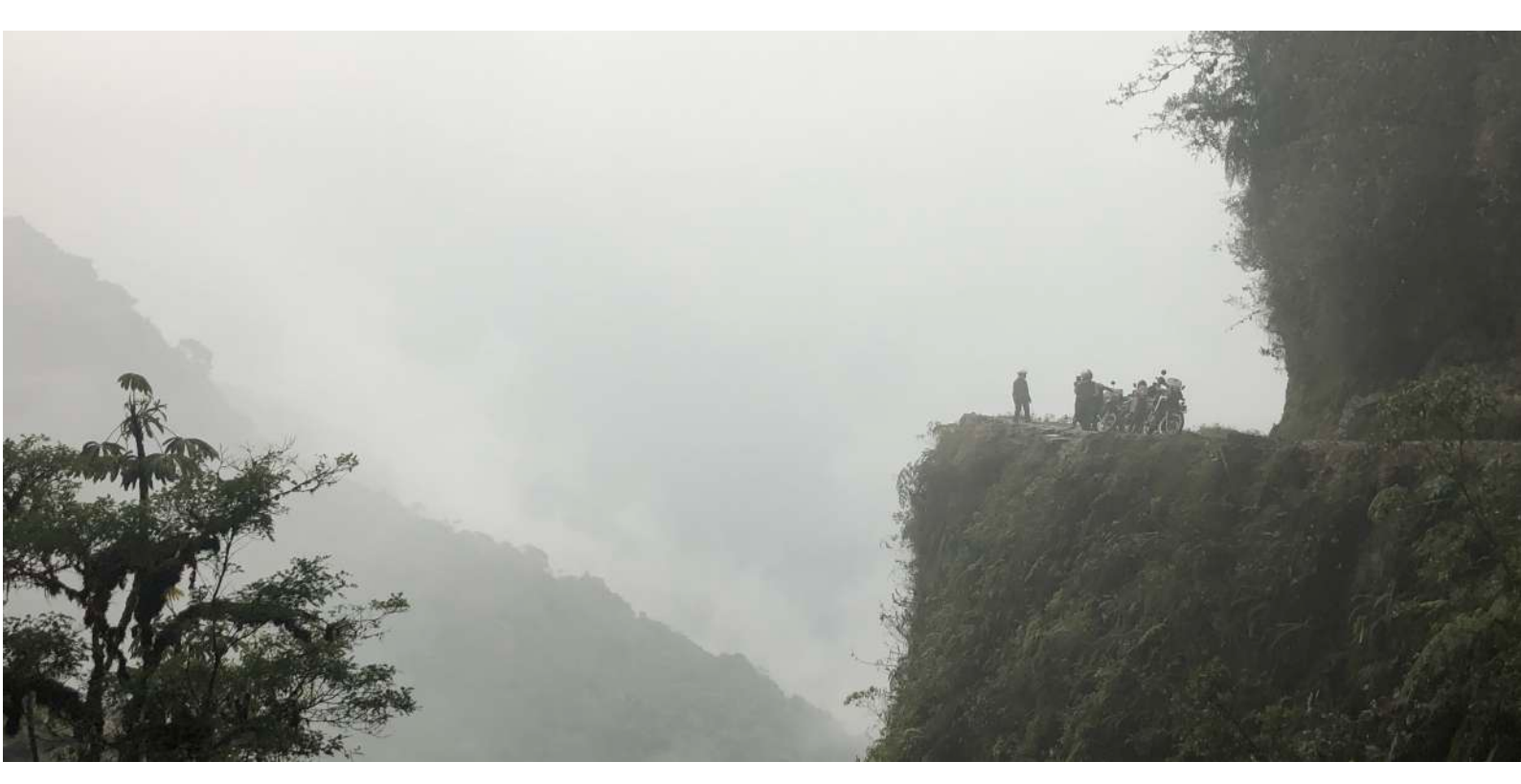
26 May Day 5. (Friday) COROICO TO LA PAZ 105KM

Overnight Coroico at a hotel. (Breakfast, Lunch, Dinner)