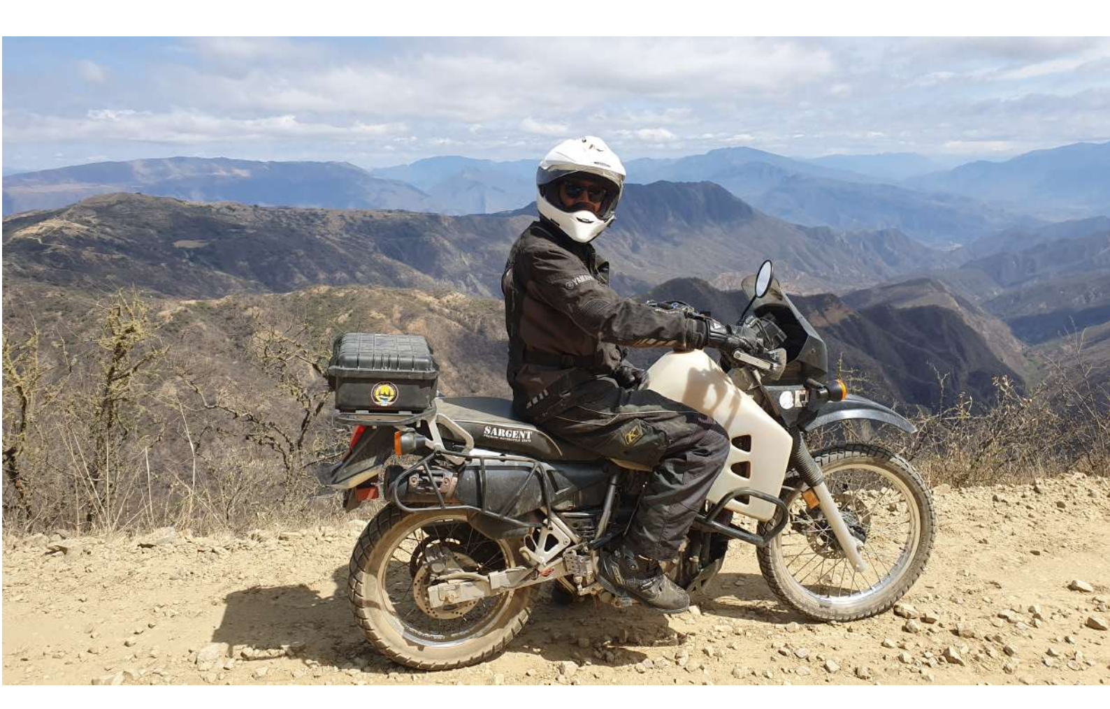
03 June Day 13. (Saturday) LA HIGUERA TO SANTA CRUZ 265KM

Overnight in La Higuera at rustic and historic homestay. (Breakfast, Lunch, Dinner)